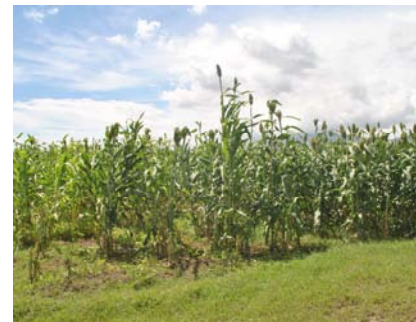
This field is the future home of Redeemer's Child Orphanage