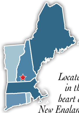
Located in the heart of New England